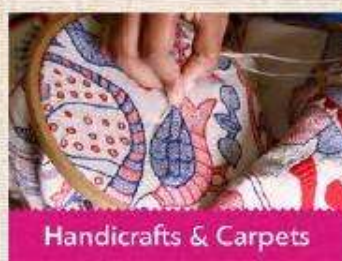
Handicrafts & Carpets