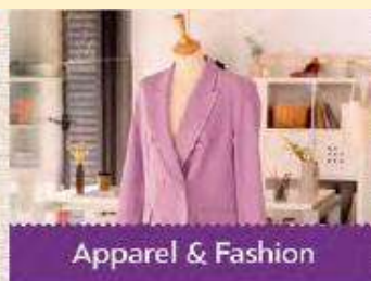
Apparel & Fashion